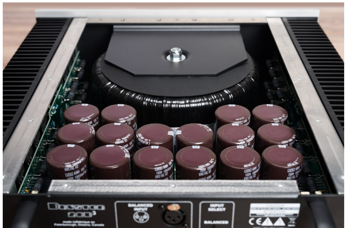
28B Mono Cubed Amplifiers Inners