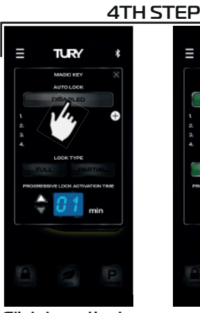
Click to activate the function