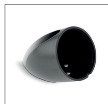
Tilted mounting frame: Easy to install