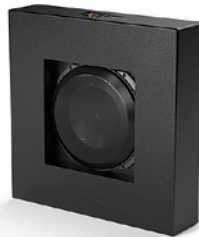
CTS-113-ST575-13TW5H Type: Single - 5.75" Deep Enclosure Driver: (1) 13TW5H Dimensions: 23.94" W x 23.94" H x 5.75" D Net Box Volume: 0.827 ft 3 Net Box Weight: 54.3 lbs (24.63 kg) Finish: Black Texture-coated