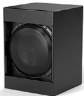
CTS-113-SD1400-13TW5H Type: Single - 14" Deep Enclosure Driver: (1) 13TW5H Dimensions: 14" W x 19.56" H x 14" D Net Box Volume: 1.185 ft 3 Net Box Weight: 46.5 lbs (21.09 kg) Finish: Black Texture-coated