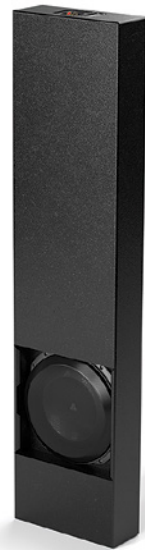
CTS-113-TT525-13TW5H Type: Single - 5.25" Deep Enclosure Driver: (1) 13TW5H Dimensions: 14" W x 58.75" H x 5.25" D Net Box Volume: 1.185 ft 3 Net Box Weight: 61.6 lbs (27.94 kg) Finish: Black Texture-coated