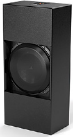
CTS-113-MD900-13TW5H Type: Single - 9" Deep Enclosure Driver: (1) 13TW5H Dimensions: 14" W x 30.69" H x 9" D Net Box Volume: 1.186 ft 3 Net Box Weight: 51.6 lbs (23.41 kg) Finish: Black Texture-coated