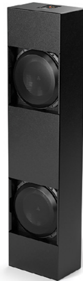
CTS-213-TD900-13TW5H Type: Double - 9" Deep Enclosure Driver: (2) 13TW5H Dimensions: 14" W x 59.20" H x 9" D Net Box Volume: 2.367 ft 3 Net Box Weight: 94.1 lbs (42.68 kg) Finish: Black Texture-coated