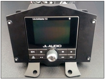
Page 3 • JL Audio, Inc., 2019

You have completed the installation for this model! Enjoy your new Stealthbox® Accessory!